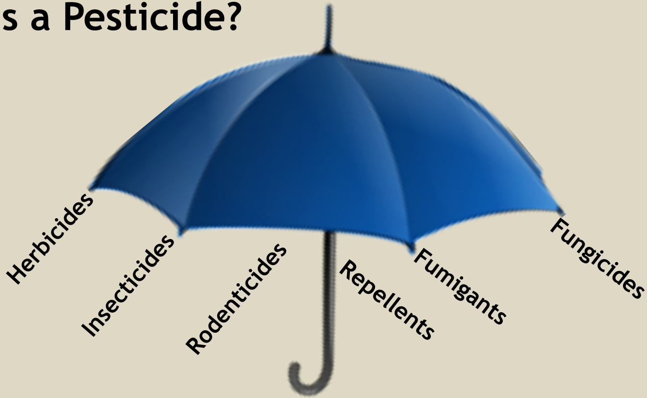
The Pesticide Umbrella