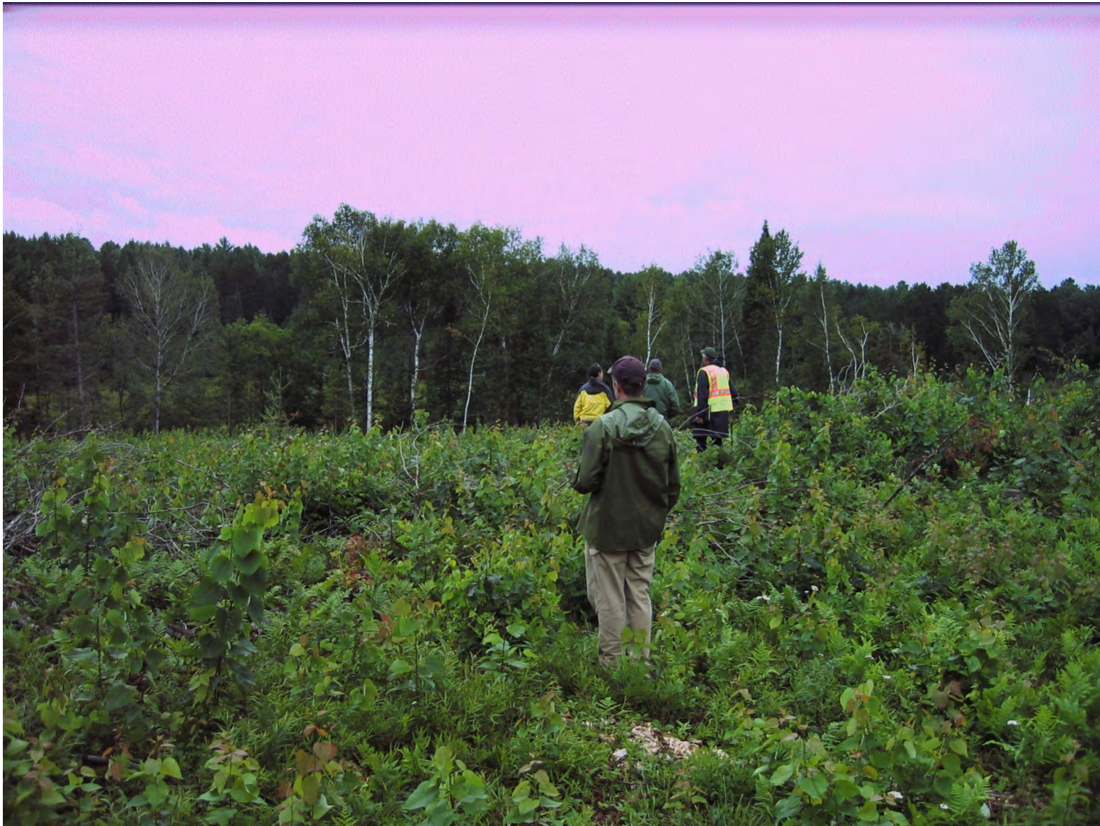
Looking at BMP buffers along streams and wetlands